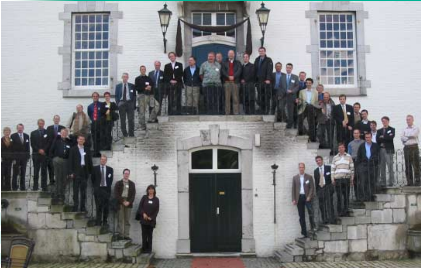
WWI management meeting in Vaalsbroek, The Netherlands, in October 2004